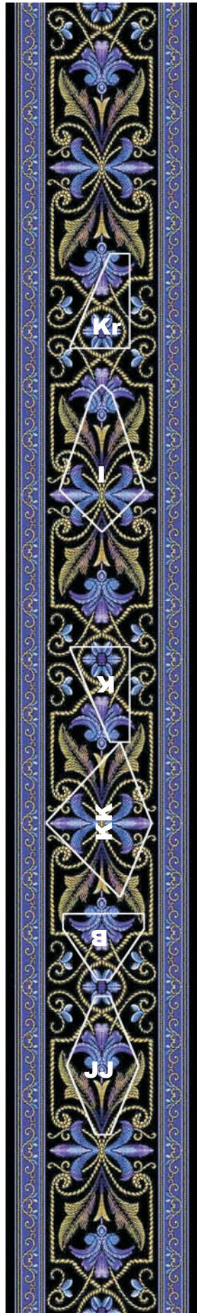
Patches cut from Templates B, JJ, KK, K, Kr and I are cut from one set of stripes.